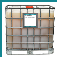
270-gallon tote SKU: MS692XT-270G UPC-12: 641238080145