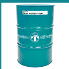
54-gallon drum SKU: MS692XT-54G UPC-12: 641238080114