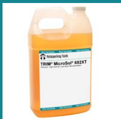
1-gallon jug SKU: MS692XT-1G UPC-12: 641238080138