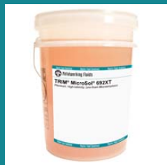
5-gallon pail SKU: MS692XT-5G UPC-12: 641238080121