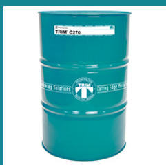
54-gallon drum SKU: C270-54G UPC-12: 641238001256