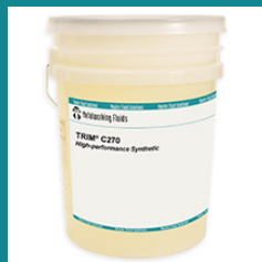
5-gallon pail SKU: C270-5G UPC-12: 641238001249