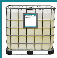
270-gallon tote SKU: C270-270G UPC-12: 641238034001