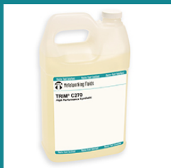
1-gallon jug SKU: C270-1G UPC-12: 641238019886