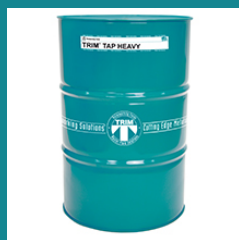
54-gallon drum SKU: TAPHVY-54G UPC-12: 641238009047