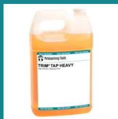
1-gallon jug SKU: TAPHVY-1G UPC-12: 641238008989